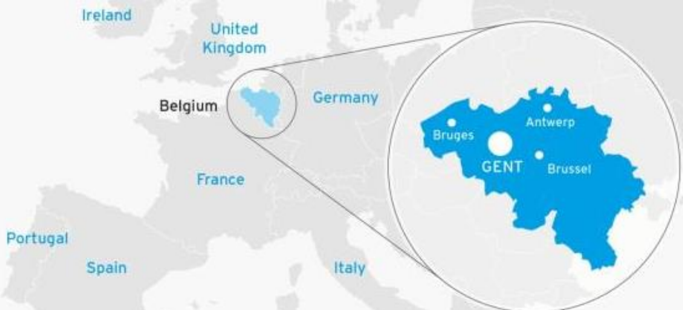
GENT: 25 WIJKEN